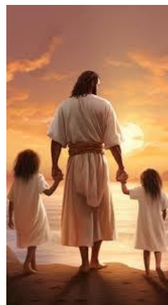
Gospel: Mark 3:20-35

The Gospel this weekend asks us to see everyone as our brothers and sisters. Jesus teaches us, as followers of Him we need to see everyone as family.